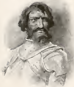
Stormy Weather Zollern.